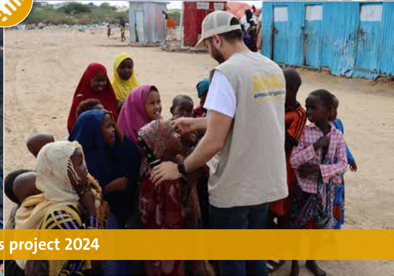
Sponsorships project 2024