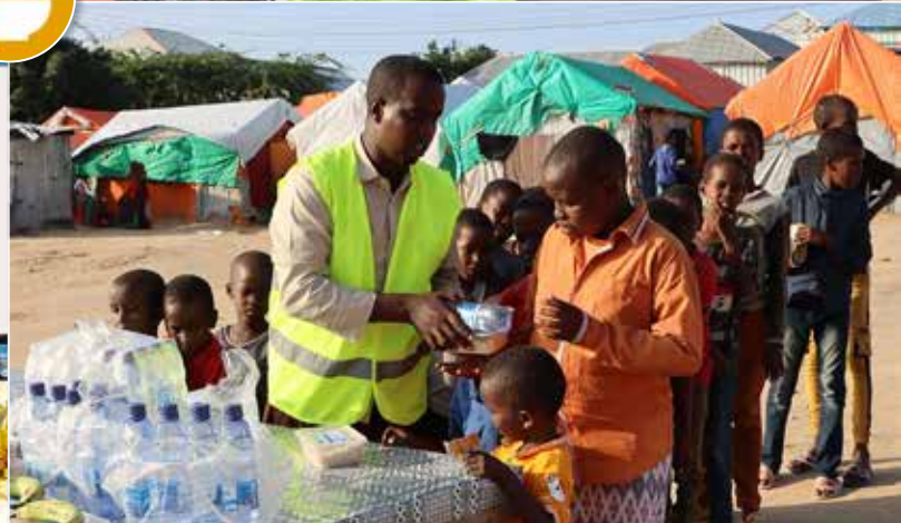
Food projects 2024