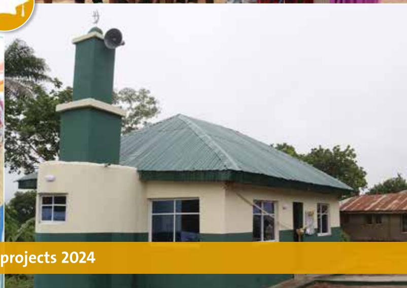
Educational projects 2024